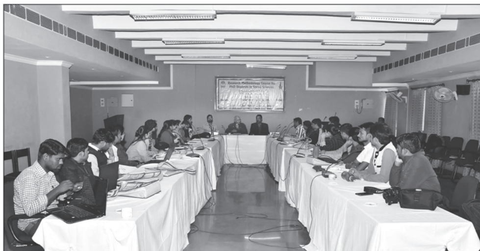
Research Methodology Course in IDSJ