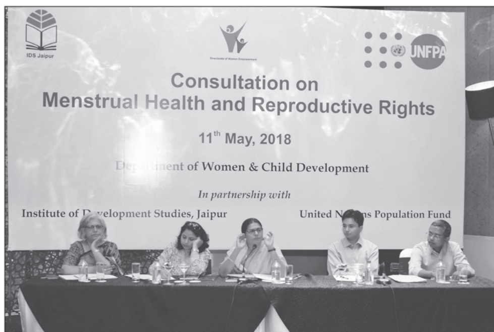
Consultative Meeting in IDSJ

Human Development Report is accepted as an advocacy cum policy document across the Globe. The acceptance of Human Development Report is reflected in the participation of country, states and districts in the preparation of the report in different countries and in India. Human Development Reports, following a standard methodology, measures the level of achievement, Deprivation and inequality across gender in the state. During the last few decades, the state has made substantial progress in increasing the quality of life of the people by introducing policies relating to food security, social security, education and health. The state has made substantial progress in Health, Education, Economic indicators in last decades. It is observed that different sub-castes and tribes within the broad domain of SCs and STs has made substantial progress in Livelihood, Employment and Education related indicators.