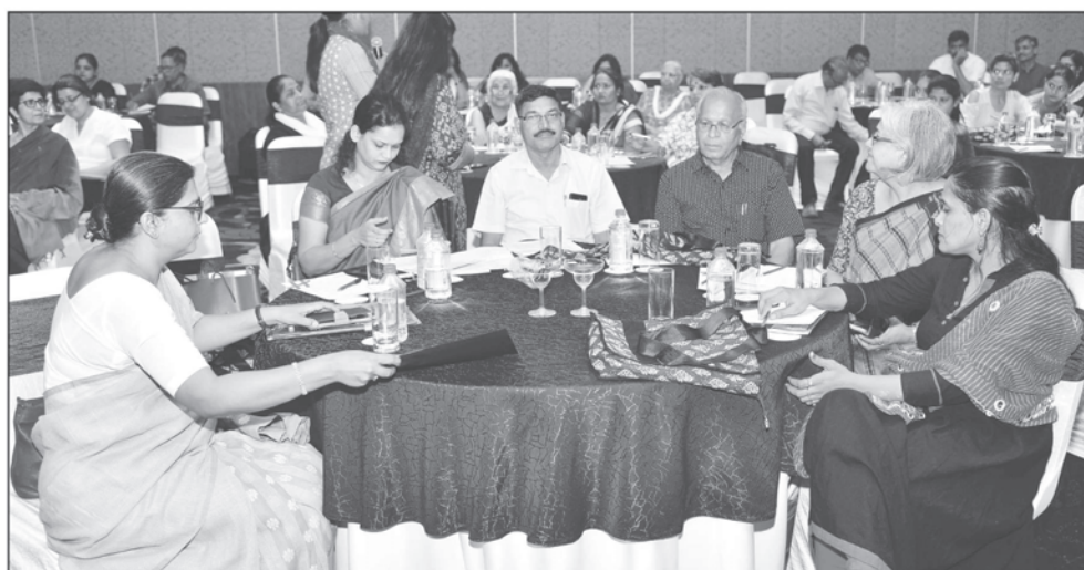
Consultative Meeting in IDSJ on May 11, 2018

This study reviewed both the policy environment and programmatic interventions and recommended a framework and design of an integrated umbrella scheme for empowerment of adolescent girls following a 'cash plus' approach (linking cash transfer with other complementary interventions, set of services and behavior change messaging). It aimed at building on and strengthening the Mukhyamantri Rajshri Yojana, a flagship scheme of the Govt. of Rajasthan launched in June, 2016.